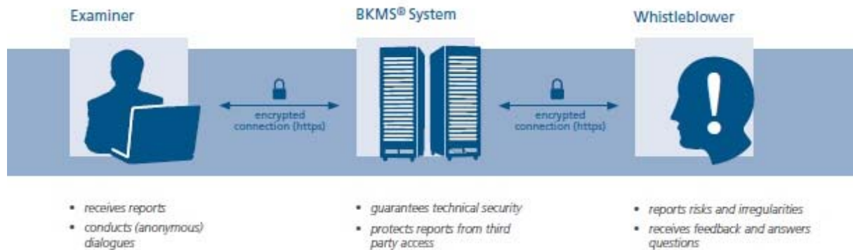
Figure 2: Security concept of the BKMS® system

The anonymous giving of tips is possible anytime and anywhere through the homepage of the customer or via the Business Keeper homepage. Through an individual encryption, every tip is secured with respect to content and channel and can only be decoded by the customer; even the Business Keeper AG has no access here. The external BKMS® server is situated in a high-security location like those used by banks, such as the European Central Bank, to secure their data and servers.